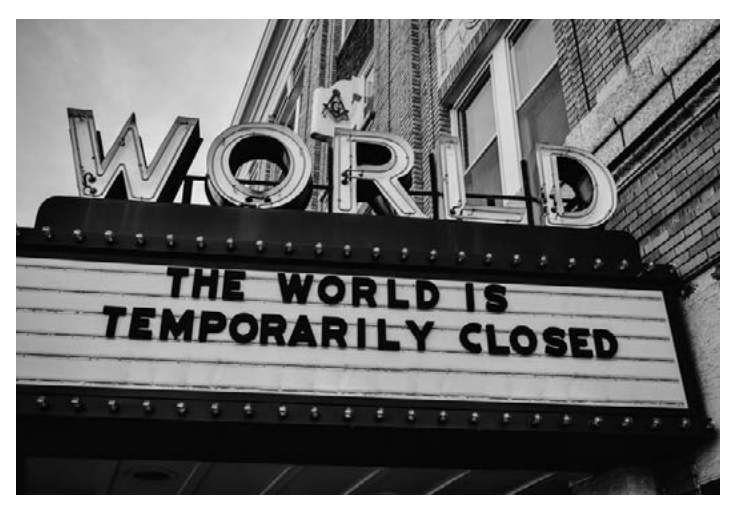
A Theatre marquee expresses public sentiments about COVID-19