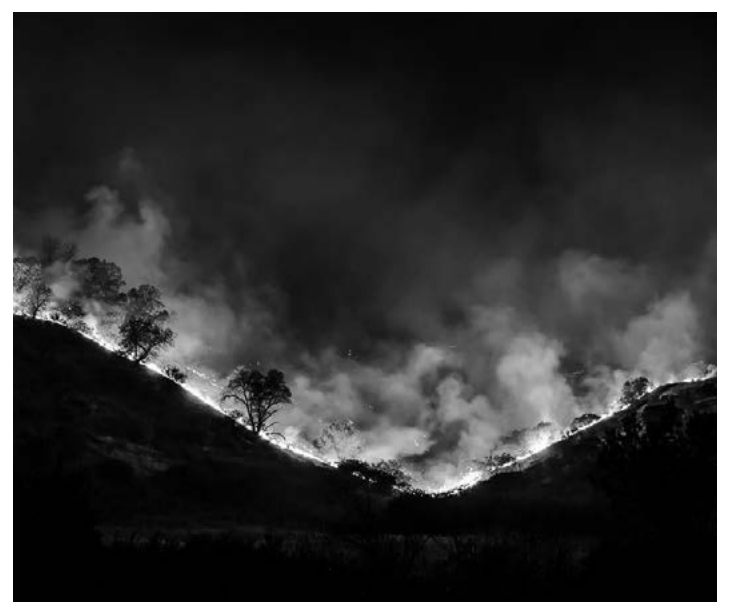
Tree ridge in flames