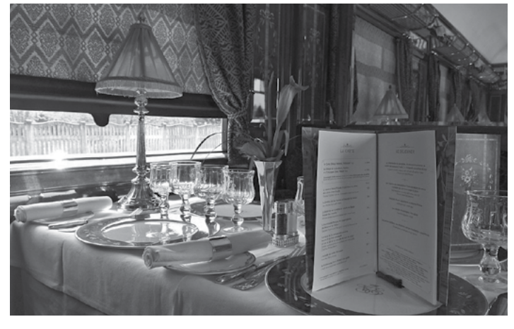
The Orient Express 'Etoile du Nord' dining car