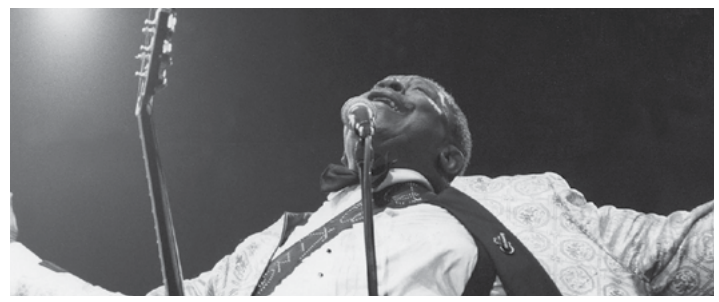
BB King in concert at the North Sea Jazz Festival, 1996